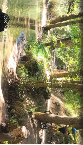
Ebro Nature Trail