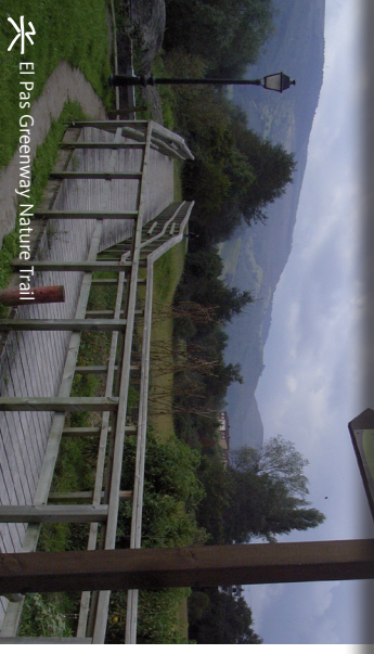
El Pas Greenway Nature Trail

The popularity of the spas in Alceda and Puente Viesgo, as well as the increase in iron production in the mining operations, were sufficient reasons to establish the Astillero-Ontaneda railroad. It was in operation for a good part of the 20th century, until 1976, and today the part of this route that has been restored as a Nature Trail allows visitors to discover the evergreen landscapes of the valleys carved out by the rivers that the railroads once crossed.