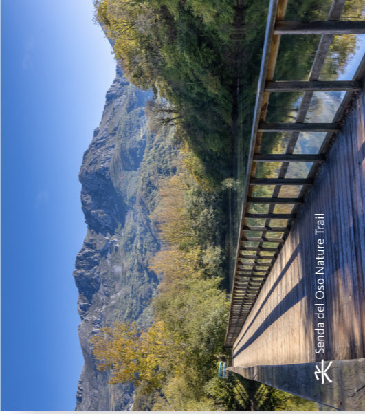
Senda del Oso, Nature Trail

The Nature Trails that may be found in Asturias and Cantabria run across villages with a rich historical heritage, in an environment of green lush landscapes, marked by the presence of deciduous woodland as a consequence of its mild, wet winters and cool summers, and where the rugged terrain shelters some almost extinct animal species.