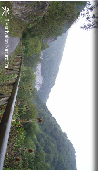
River Nalón Nature Trail