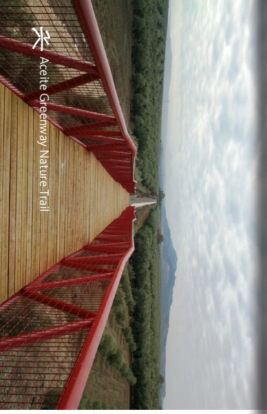
Aceite Greenway Nature Trail