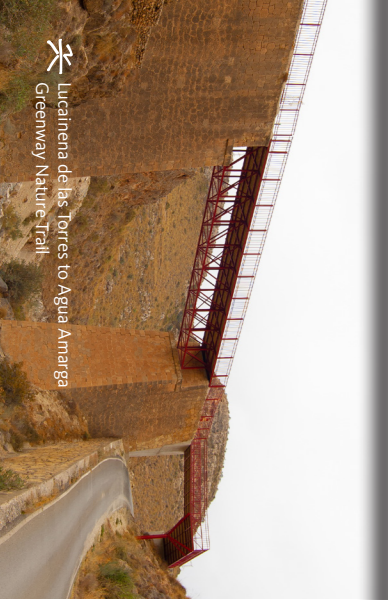
Lucainena de las Torres to Agua Amarga Greenway Nature Trail