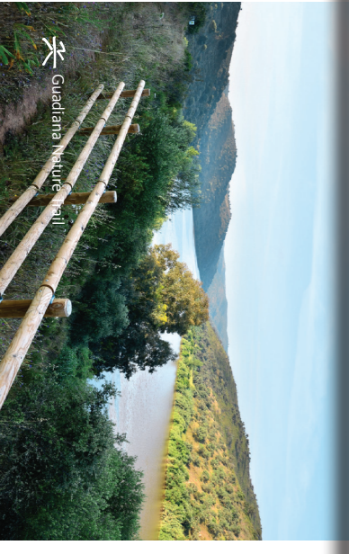
Guadiana Nature Trail

Los Molinos de Agua Greenway (Huelva). This route runs through the province of Huelva, along the old railway line that joined the Butrón mines with the dock owned by