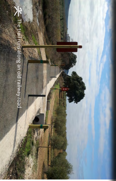
The trail runs along an old railway road

Thus, said union between villages took place during the regency of María Cristina (by Royal Decree, on 10th December, 1834), leading to the current name of Puente Genil, which makes obvious reference to the physical means that allowed said integration: the bridge (puente in Spanish) that crosses the course of the Genil river and joins both banks.