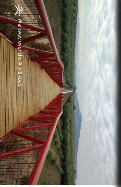
Walkway over the A-318 road