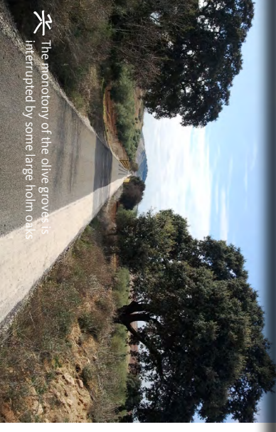
The proximity of the olive groves is interrupted by some large holm oaks