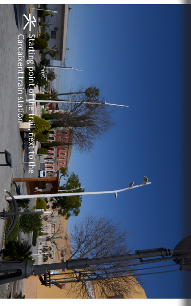
Starting point of the trail, next to the Carcaixent train station