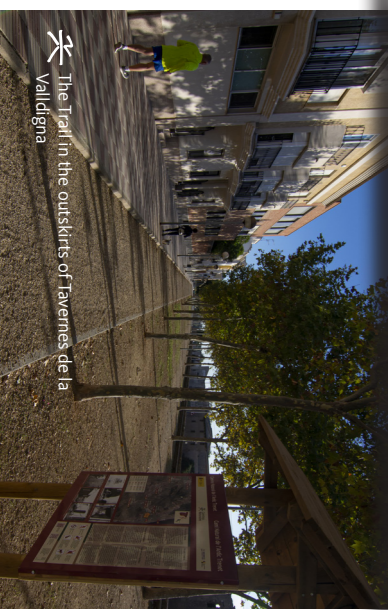
The Trail in the outskirts of Tavernes de la Vallidigna