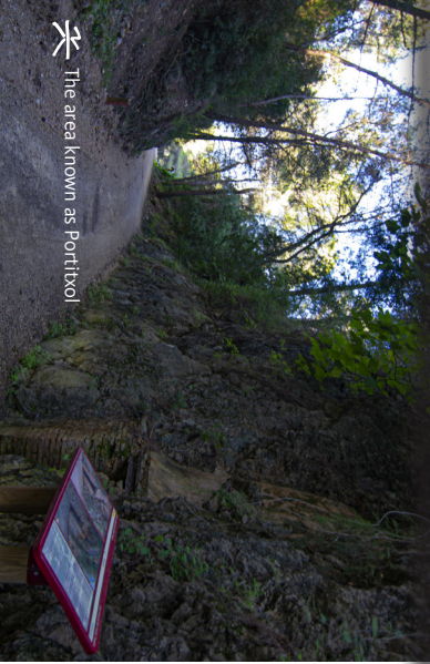
The area known as Portitxol

Due to the lack of investments, the use of the Trenet was abandoned in favour of road transport, which led to the closure of the railway line. In 1969, the journey between Carcaixent and Gandia ended and 5 years later, between Gandia and Denia.